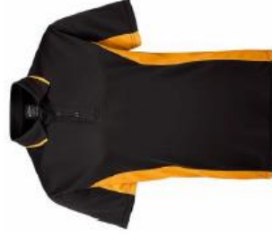
School Polo Shirt