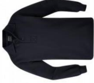
Polo Neck Windcheater