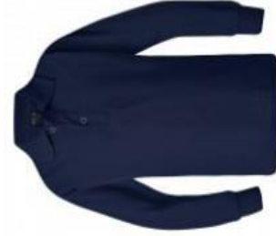
Long Sleeve Plain Polo Shirt