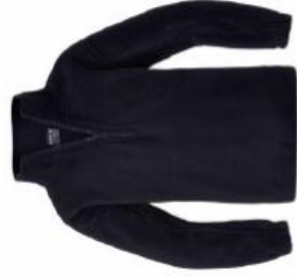
Polar Fleece Half Zip