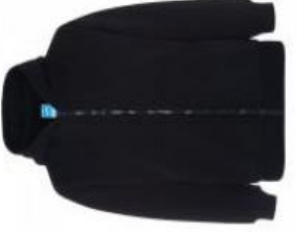
Hooded Windcheater Zip Jacket