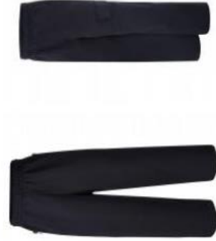
Straight Leg Trackpants