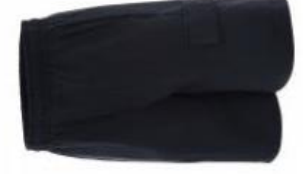
Garberdine Cargo Shorts