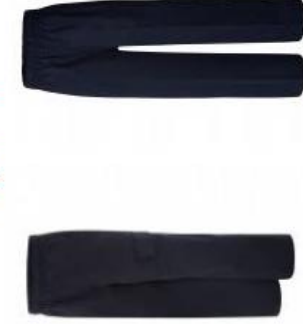
Garberdine Cargo Pants