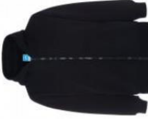
Hooded Windcheater Zip Jacket