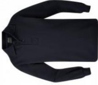
Polo Neck Windcheater