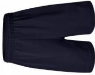
Rugby Knit Shorts