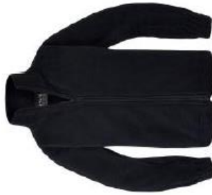
Polar Fleece Zip jacket