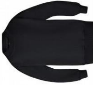
Crew Neck Windcheater