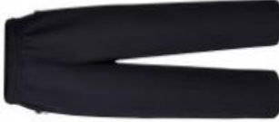
Straight Leg Trackpants