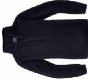
Polar Fleece Half Zip