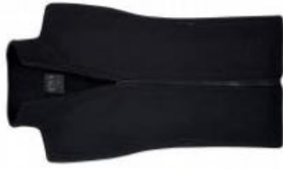
Polar Fleece Vest