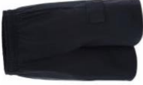
Garberdine Cargo Shorts