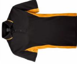
School Polo Shirt