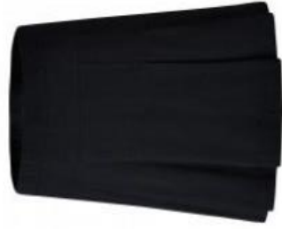
Pleated Sport Skirt