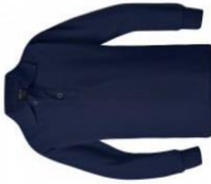
Long Sleeve Plain Polo Shirt