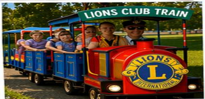
LIONS CLUB TRAIN