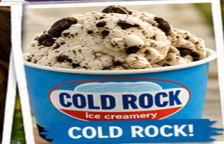
COLD ROCK ice creamery COLD ROCK!