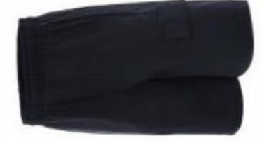
Garberdine Cargo Shorts