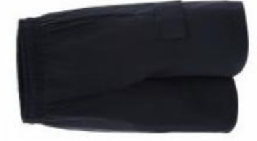
Garberdine Cargo Shorts