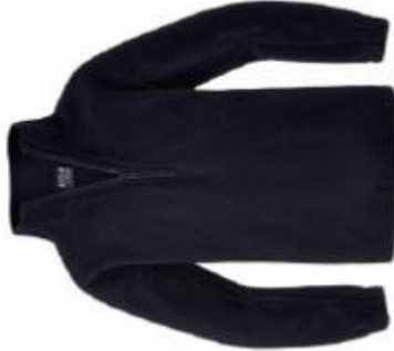
Polar Fleece Half Zip