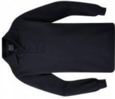
Polo Neck Windcheater