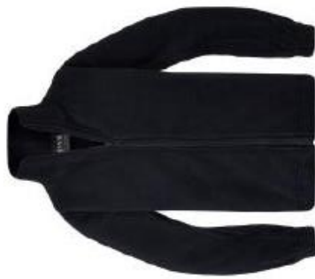
Polar Fleece Zip jacket