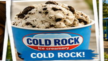
COLD ROCK! COLD ROCK!