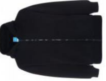
Hooded Windcheater Zip Jacket