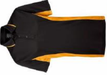
School Polo Shirt