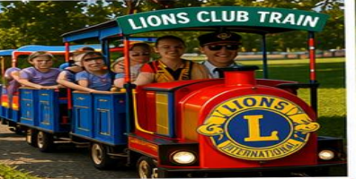
LIONS CLUB TRAIN