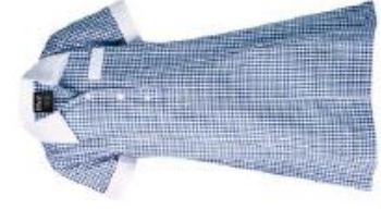
Check School Dress