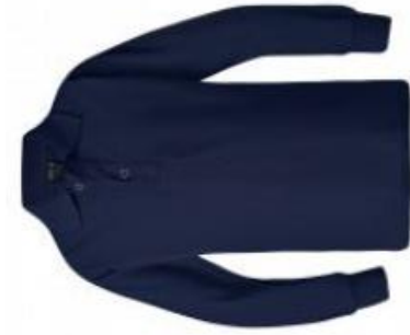
Long Sleeve Plain Polo Shirt