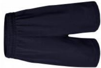
Rugby Knit Shorts